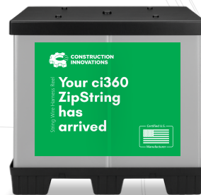
Shipped in a variety of reusable, easy-unload packages