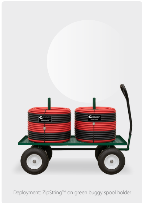
Deployment: ZipString™ on green buggy spool holder

Paired with ci360™ String Wire Management, ZipString's™ tool-free design supports both under-torque-tube and back-of-module mounting to make installation intuitive for crews of any experience level. Just set ZipString™ on the CI-provided spool holder and pull it down the row in a matter of minutes for string wire install that eliminates re-work, is safer to handle, and delivers a more predictable build.